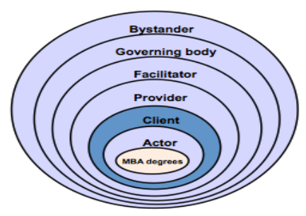
Figure 1: CRM roles influencing HEI output.

of an MBA programme output (see Figure 1), stakeholders might be: Actor - programme director; Client - MBA students, supporting companies; Provider - financial departments, teaching staff, Facilitator module conveners; Research Governing supervisors, admissions; body University Bystander: senate: business organisations, community institutions, press agencies, etc. The list of customer groups should categorise all stakeholders involved in the lifecycle of the focal output.